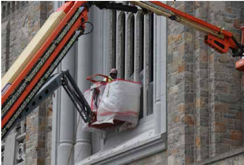
Demolition of the Notre Dame Church slowly continued on June 27, 2018.