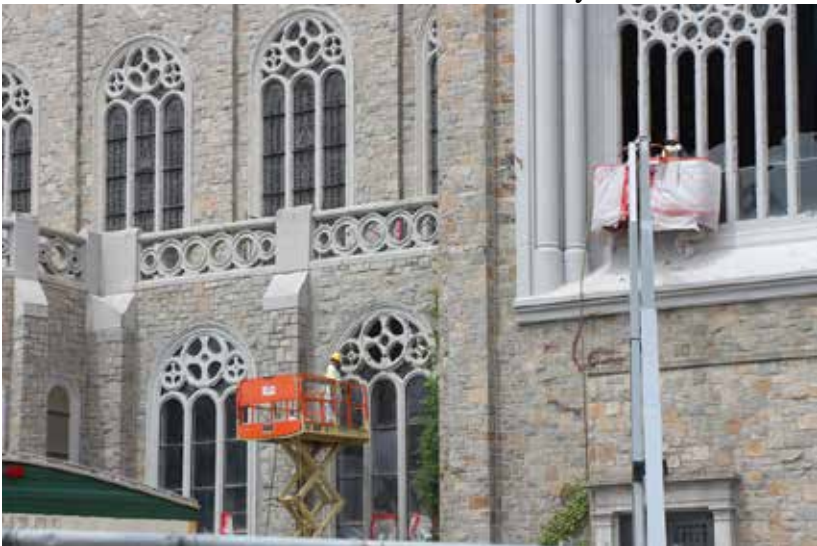
Demolition of the Notre Dame Church slowly continued on June 27, 2018.