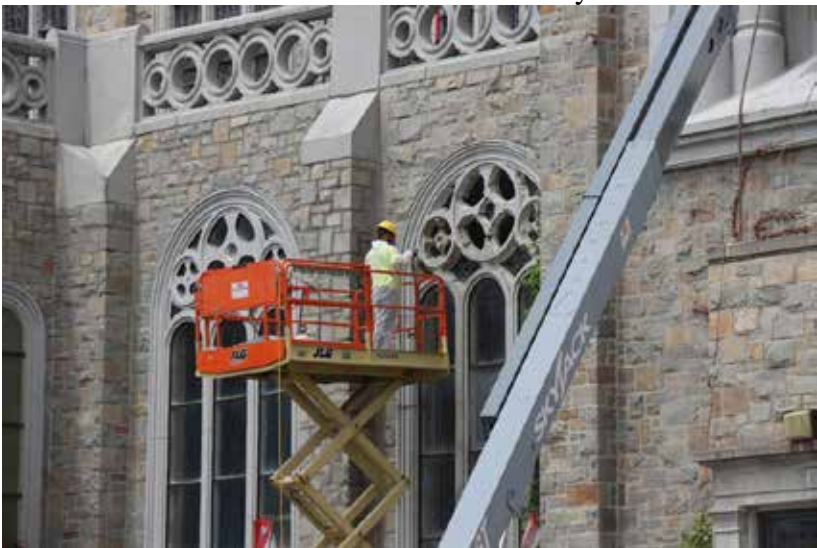
34 / 44