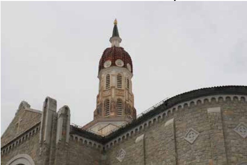
40 / 44