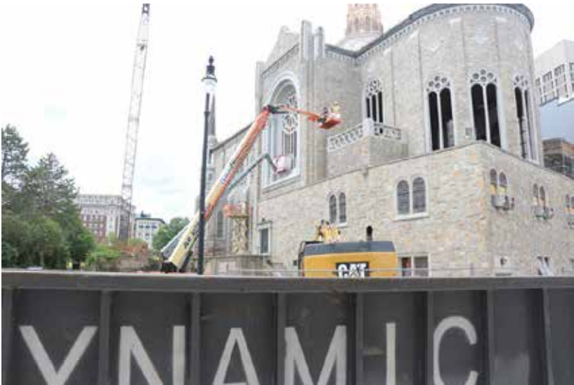
35 / 44