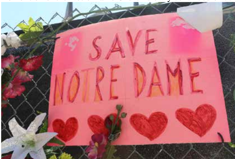
Demolition of the Notre Dame Church slowly continued on June 27, 2018.