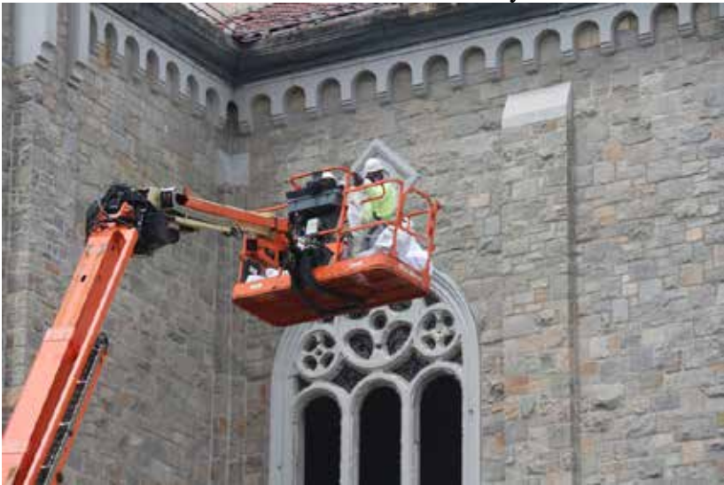
33 / 44