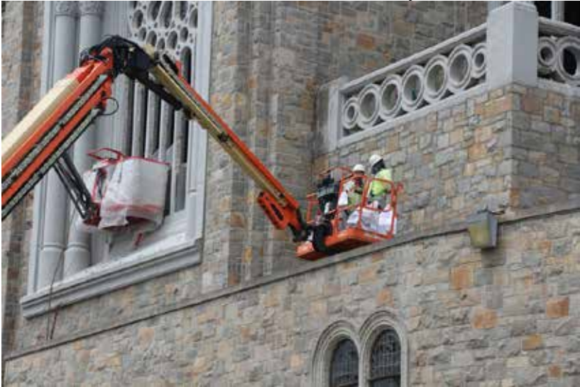
39 / 44