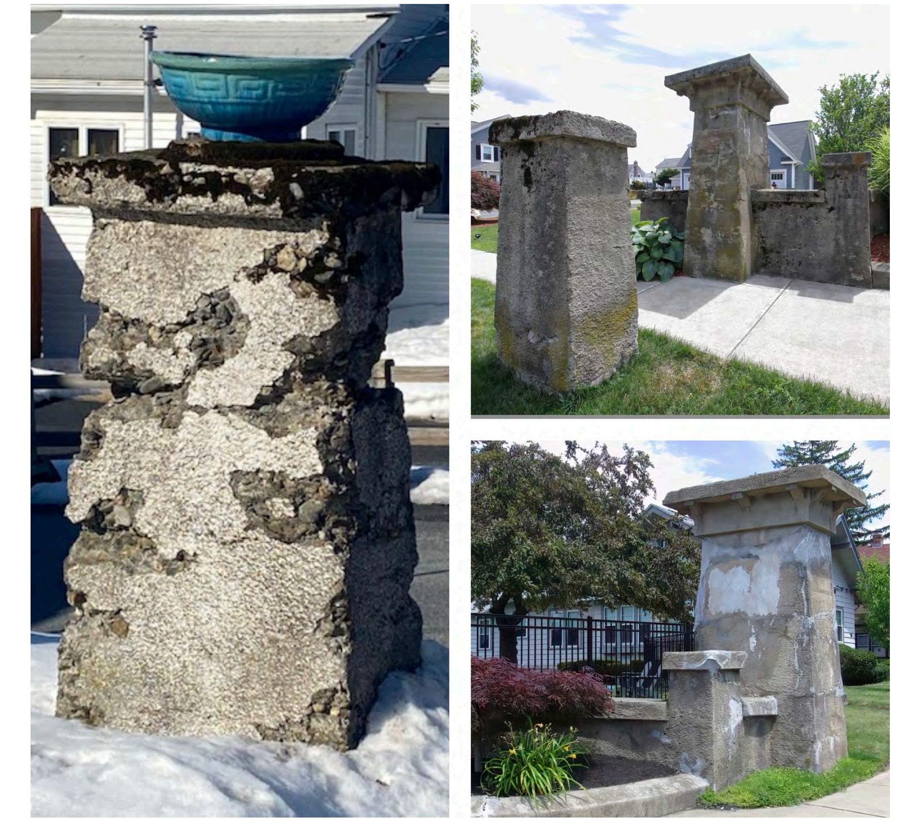
Pillars/Monuments O'Connell & Haines Developments | circa 1907-1920s