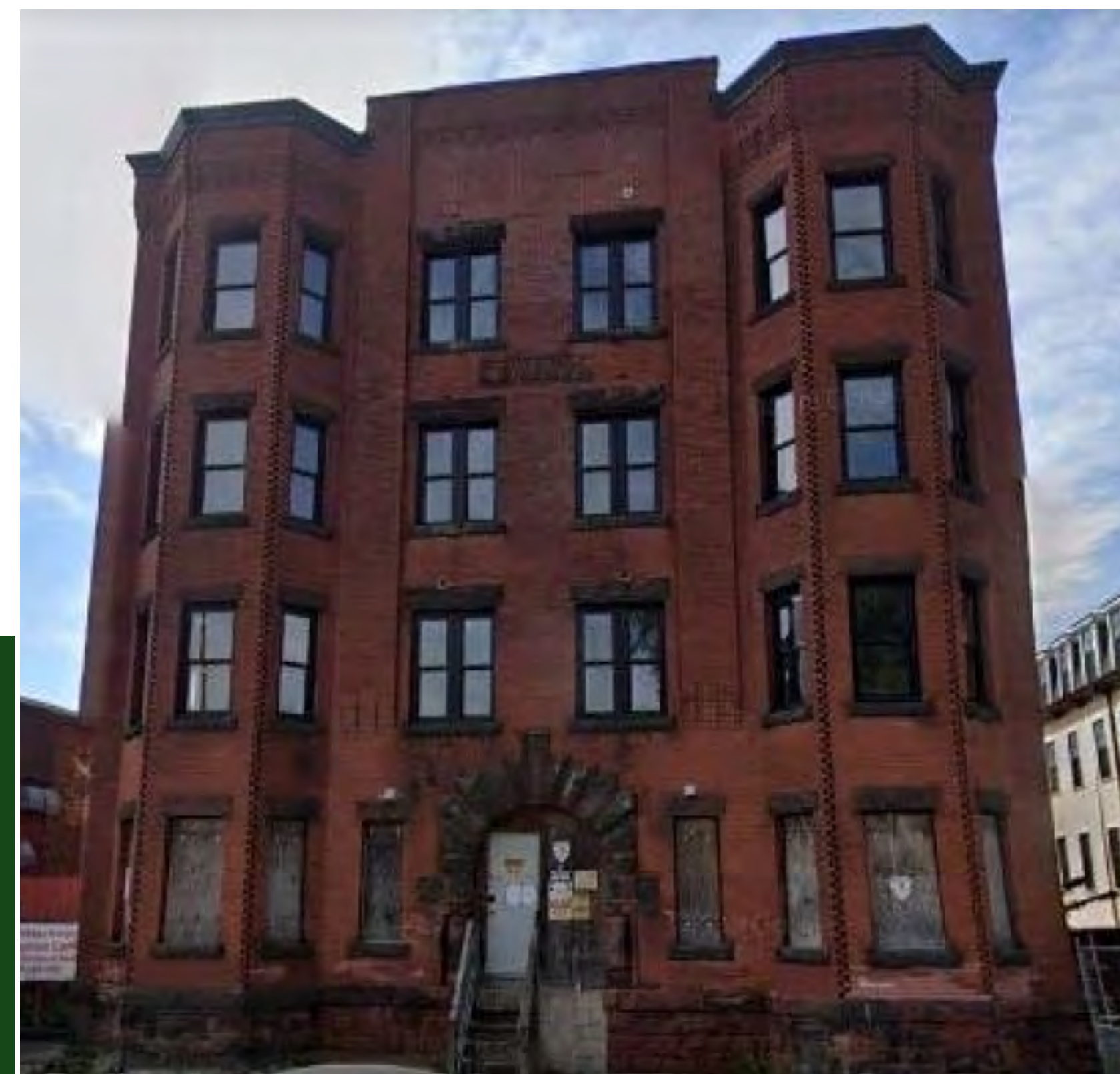
Hammond Reed Company House 5 May Street | circa 1895