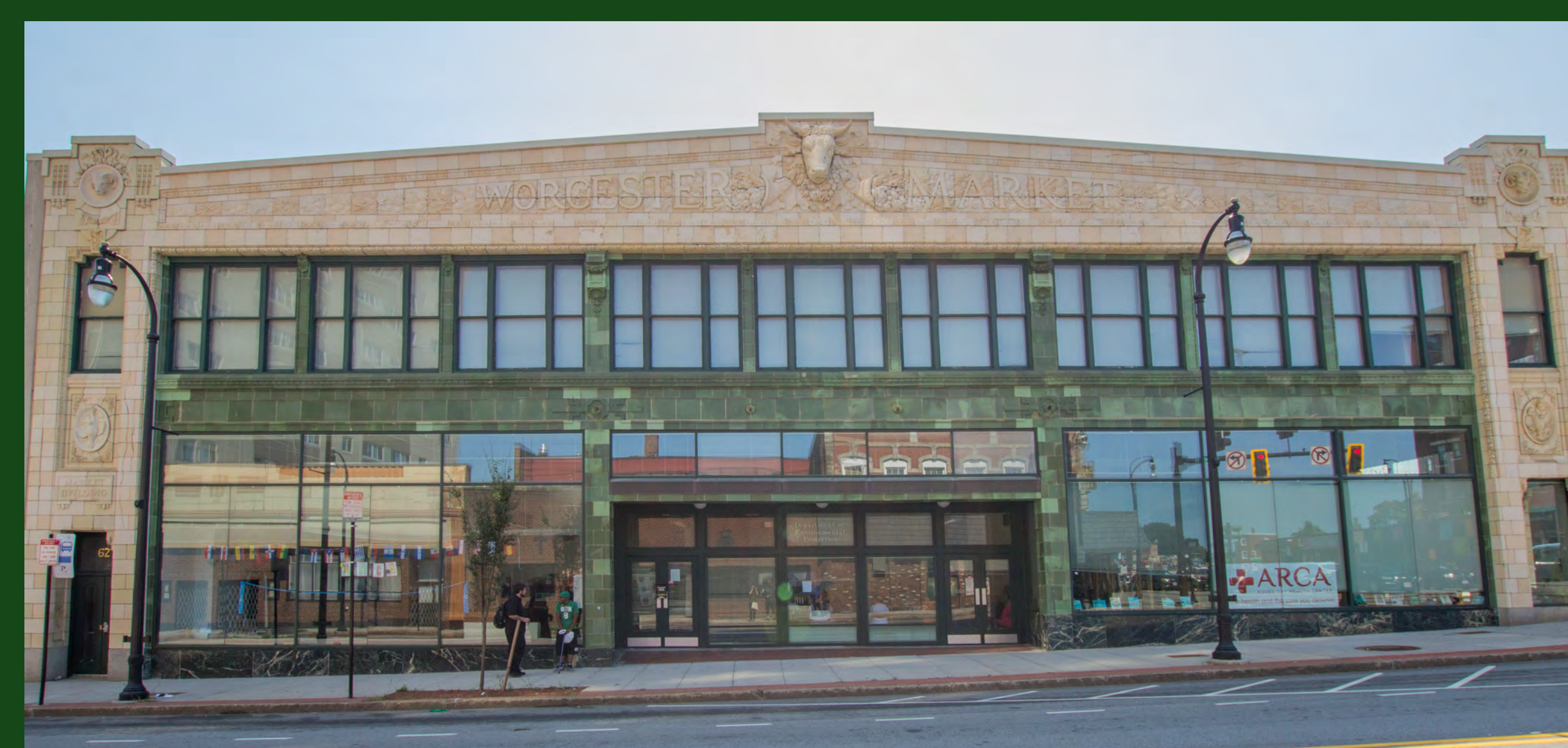
Worcester Market 627 main Street | circa 1914