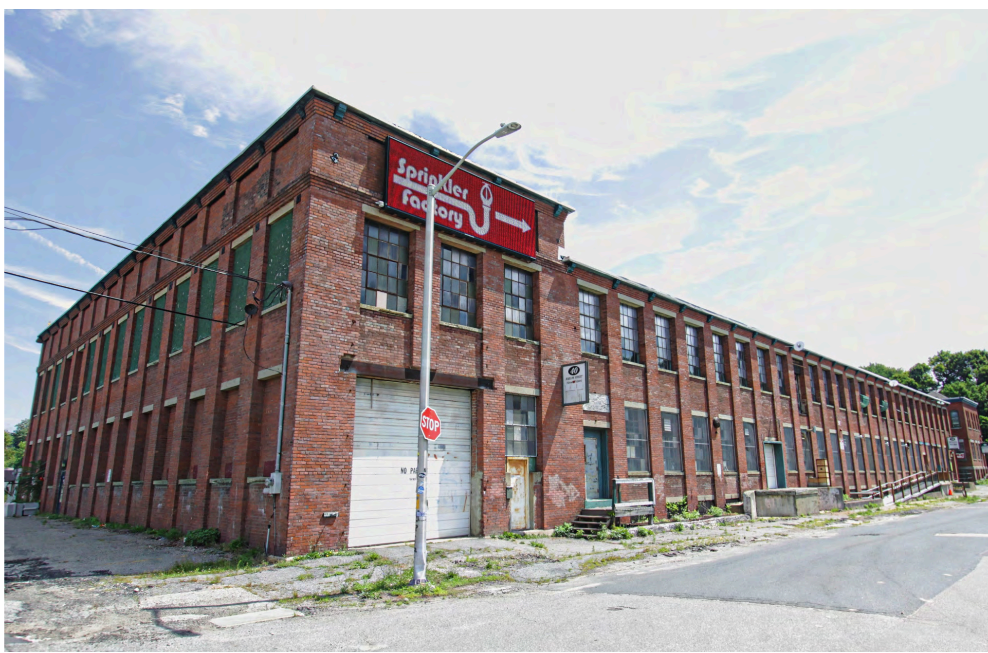
Rockwood Sprinkler Co. (Sprinkler Factory) 38 Harlow Street | circa 1893