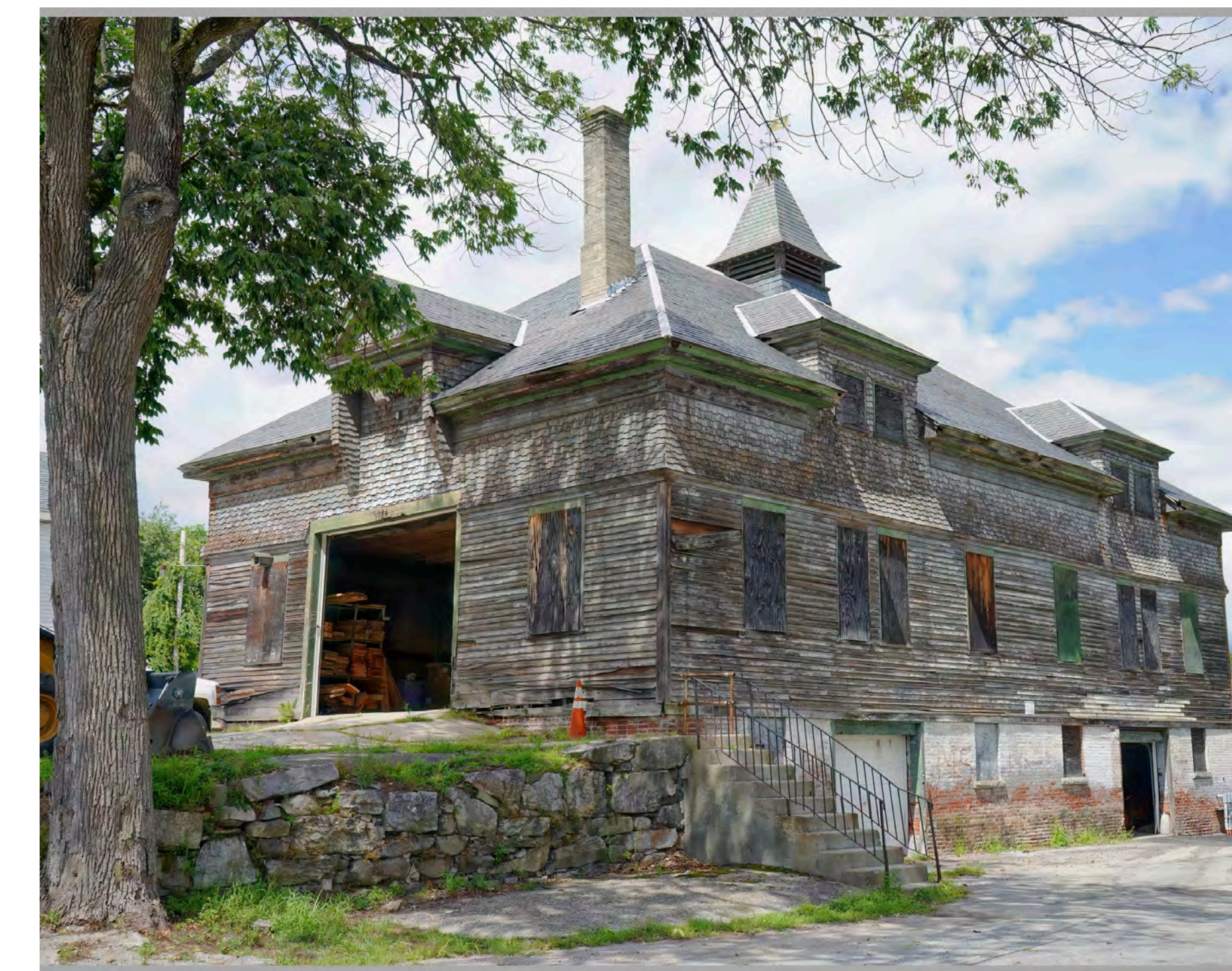
Barn at Hope Cemetery Webster Street and Hope Avenue | circa 1882