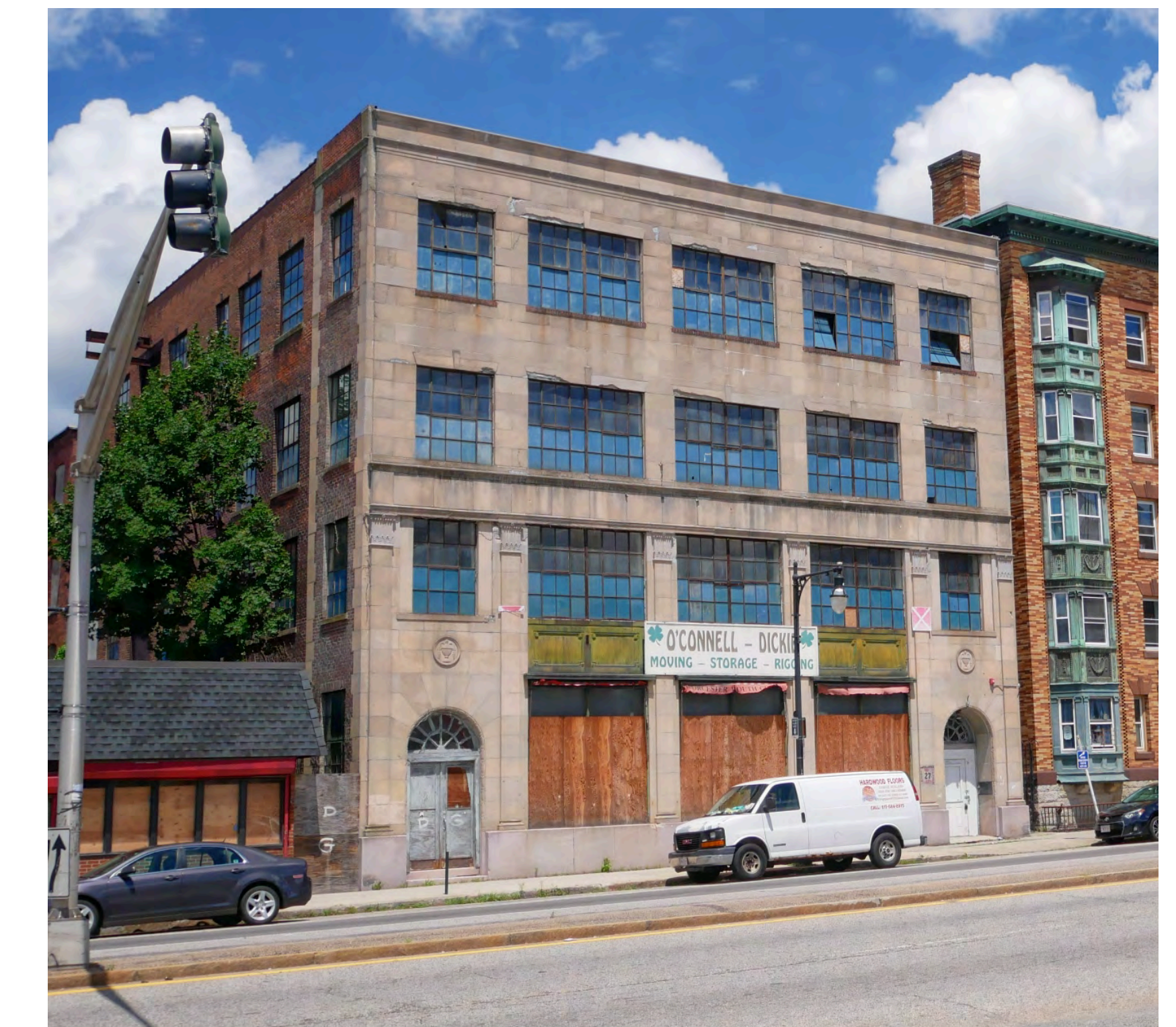
Thomas A. Wall - Thomas Grove 3 - Decker 525 Vassar Street | circa 1+8+