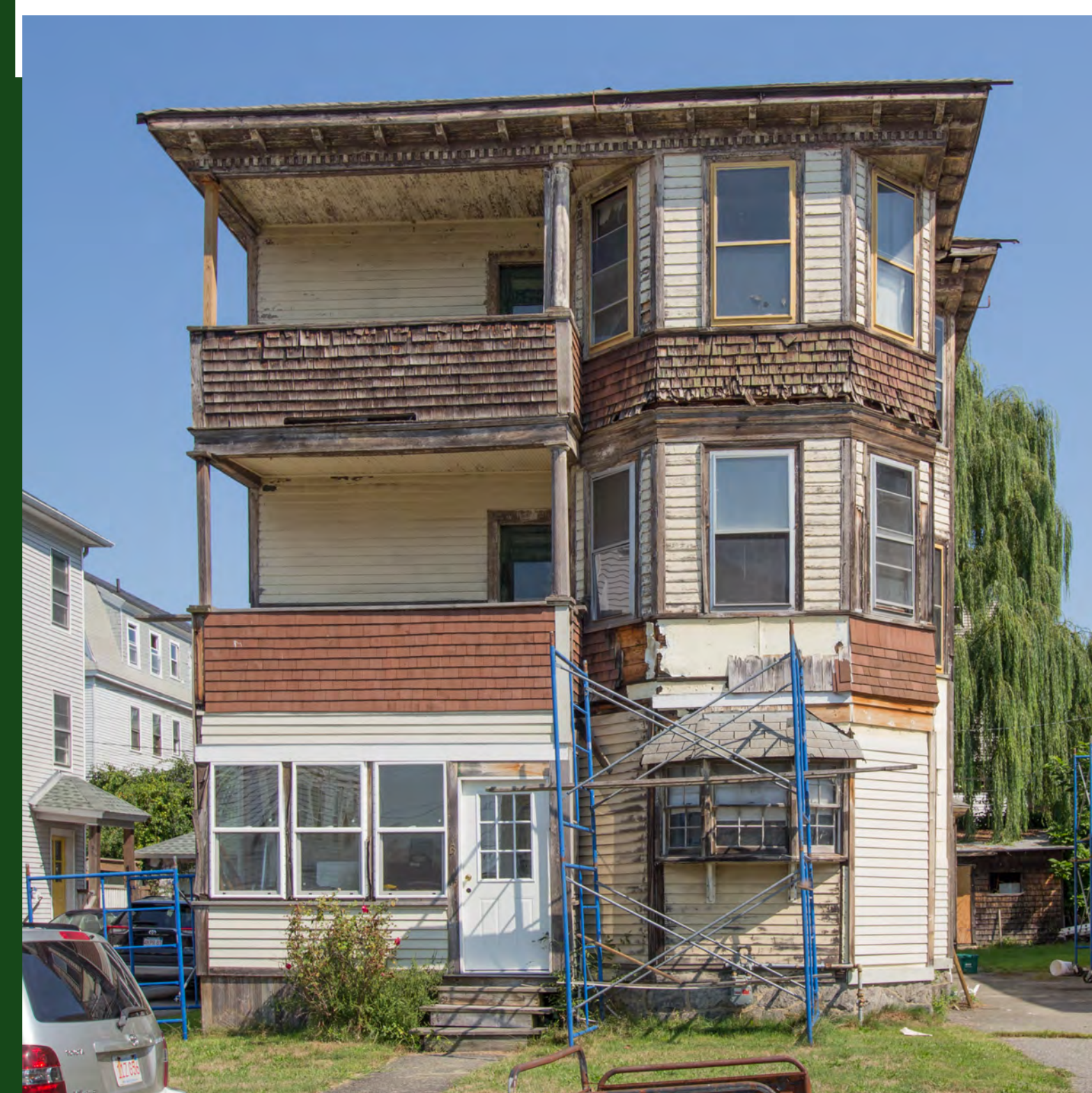
Thomas A. Wall - Thomas Grove 3 - Decker 3 Ives Street | circa 1914