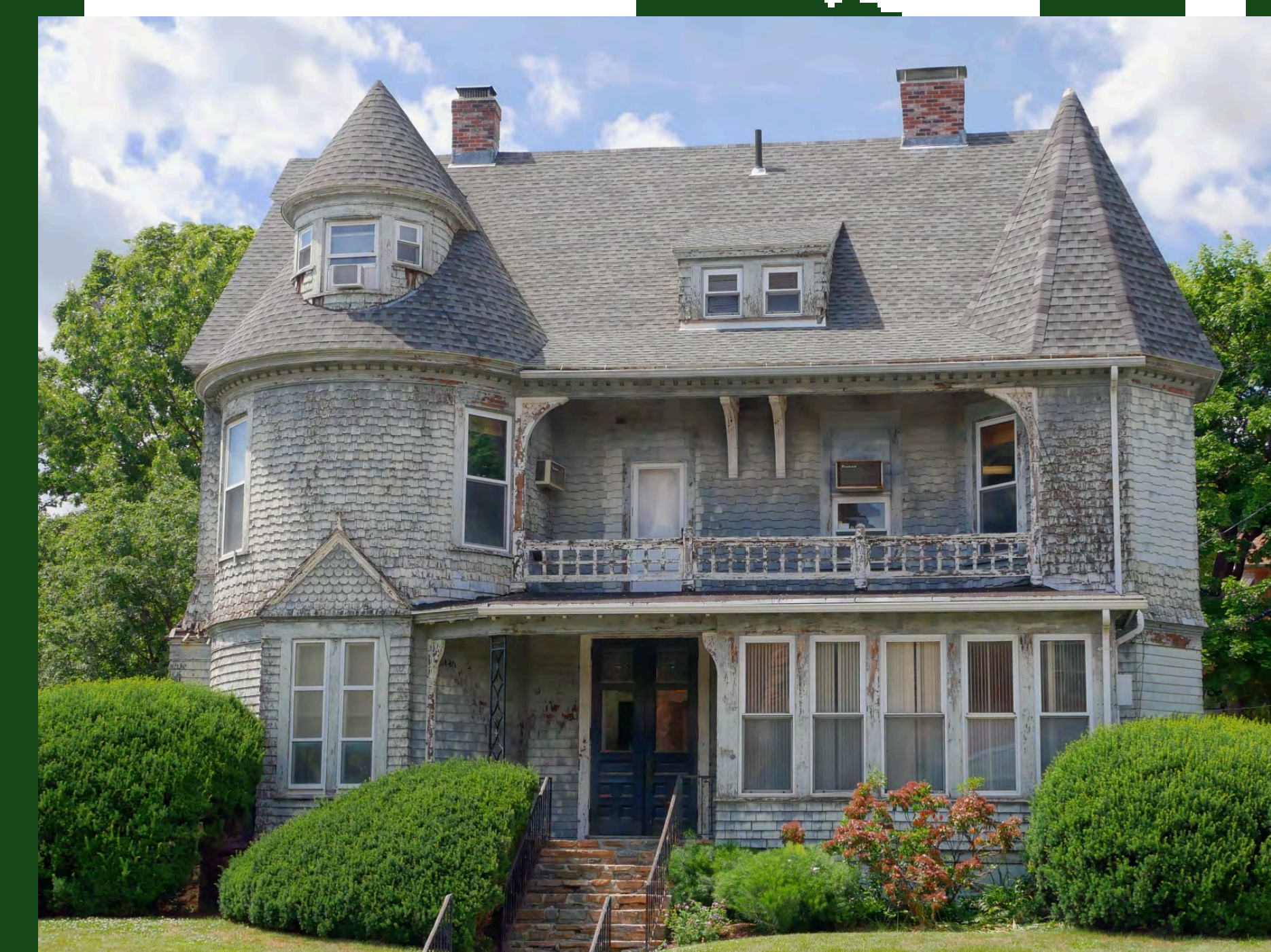
J. Frank Quinn House 900 Main Street | circa 1887