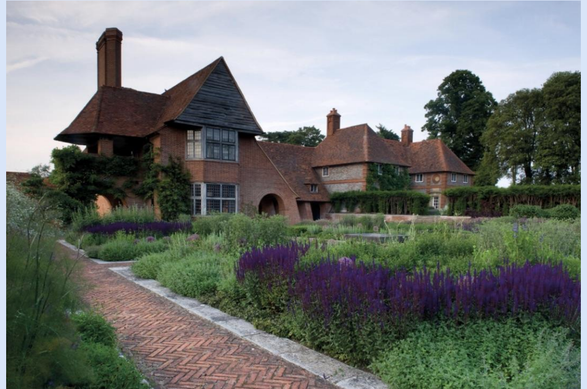
Sir John Soan